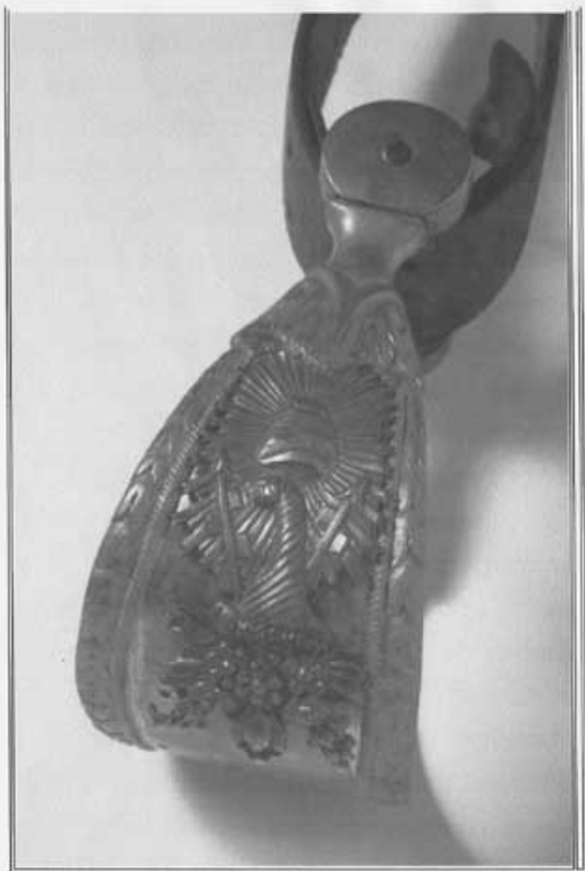
Powered by VTL5 Engine