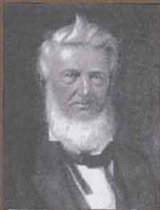
David G. Burnet