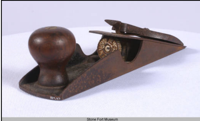
Stone Fort Museum