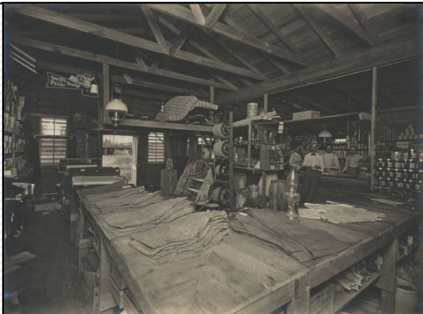
East Texas Research Center

En aquel tiempo no había tiendas supers. Había tiendas locales.