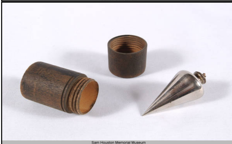
Sam Houston Memorial Museum