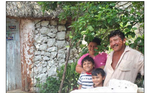
A Mayan family in Kinchil, Yucatan, Mexico stands before their thatched stone home