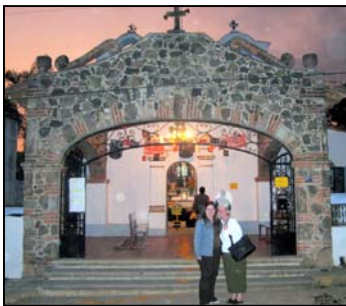
Texas Social Studies teachers in Cuernavaca, Mexico

TIDES staff are eager to include Texas teachers in trips to Mexico to experience, firsthand, Mexican culture and natural history.