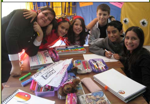
Texan and Mexican schoolchildren working together to complete an art project in Cuernavaca, Morelos, Mexico

TIDES offers a bilingual digital gateway to rich historical, cultural and scientific resources held in Texas and Mexico libraries, museums, archives, historical societies, private collections, state parks and wildlife preserves. These resources (photographs, scanned documents and artifacts, video and more) are accompanied by custom-made, standards-based curriculum material and are freely available to teachers, students, and researchers worldwide.