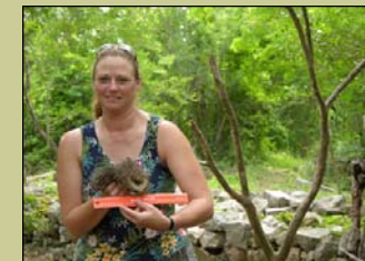
A Texas elementary school science teacher at Dzibilichaltun, Yucatan, Mexico